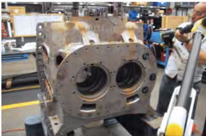
An NVision technician scanning a section of housing with a handheld laser scanner. A handheld scanner measures an object's 3D coordinates quickly, with a high degree of resolution and accuracy.

Plants and factories are also now utilizing larger-scale 3D scanning.