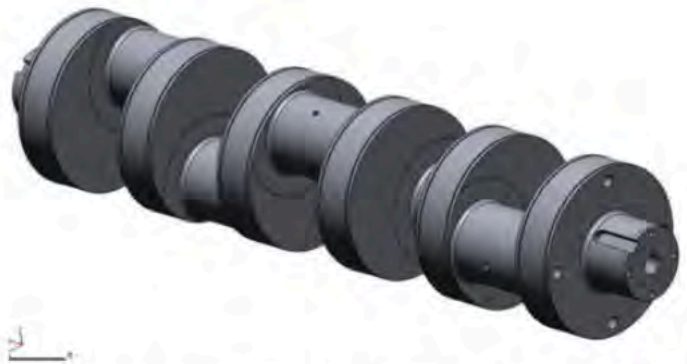
A CAD model of the same crankshaft produced by 3D laser scanning.

Many petro chemical manufacturing plants stacks only shut down for three months every seven years. For every day they go past the 90-day downtime mark the cost is several million dollars. By utilizing different scanning technology they can model existing structures/piping/equipment. This saves time and money by allowing the supplier to know how they are going to move multi-ton equipment to upper