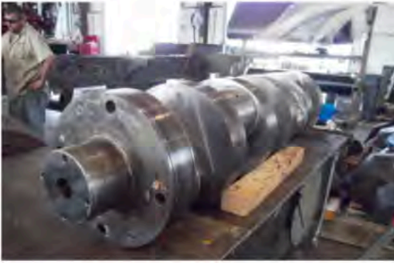
A crankshaft that required reverse engineering.