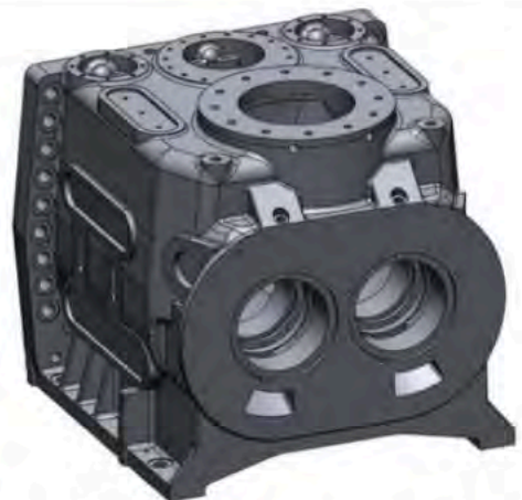
A CAD model of the same housing produced by 3D laser scanning.