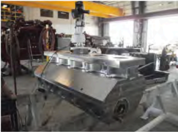
A Y-block for a fracking pump.